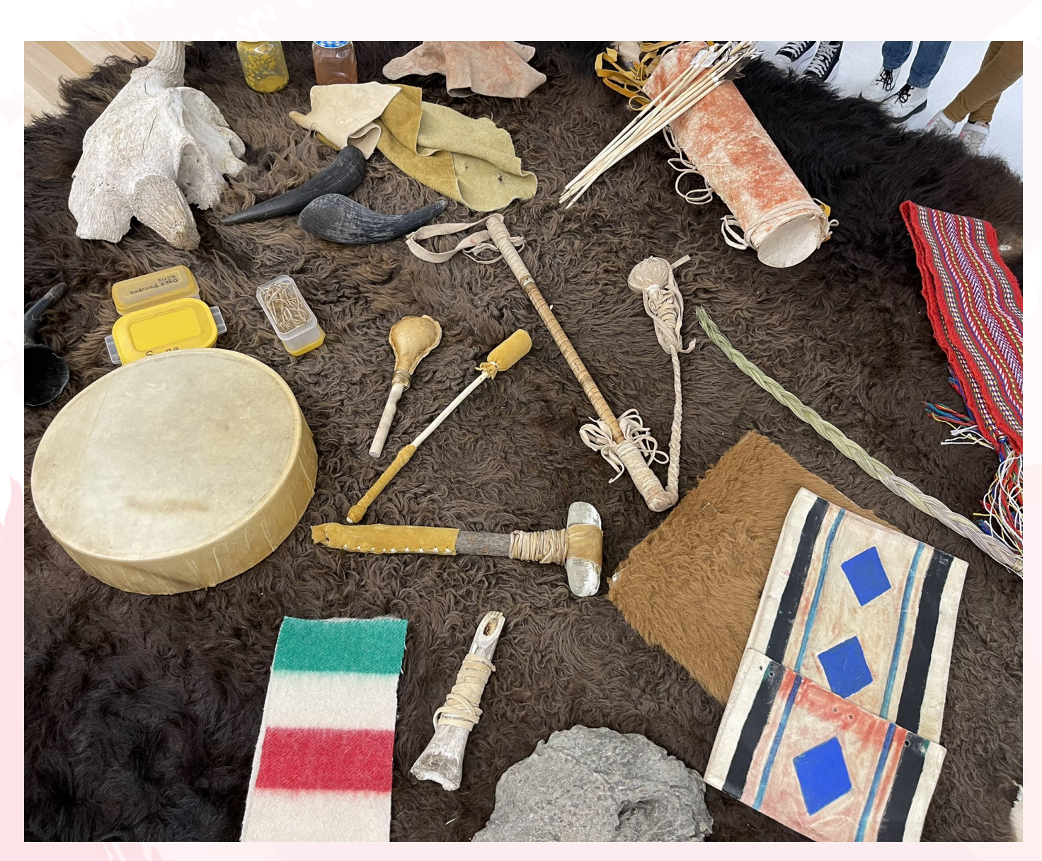
BUFFALO KIT AT G. S. LAKIE